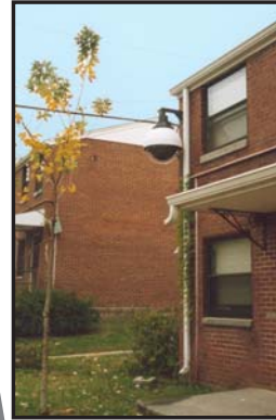
In the early 1990's Franklin Heights residents were subjected to violent crime and out-in-the-open drug sales. Videolarm's first bullet-resistant camera, the BMF27, was installed at the complex in 1996. The camera has been a critical component in making the Franklin Heights safe again.