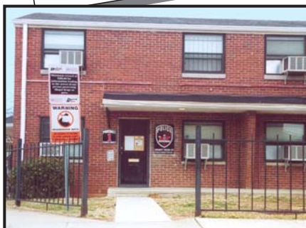
Officials are using one of the four bedroom units as their Social Service Building. It includes a Police Precinct where officers monitor activity in the complex.