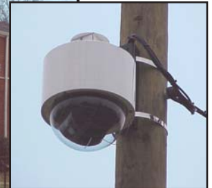
The new generation of bullet-resistant cameras, the DeputyDome™, was installed in 1999 at Highland Heights. Crime reduction was almost immediate.