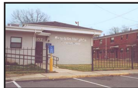
As part of the entire community rebuilding project, the Housing Authority offers a pre-school and is building a recreation center.

“Your cameras have made all the difference!”